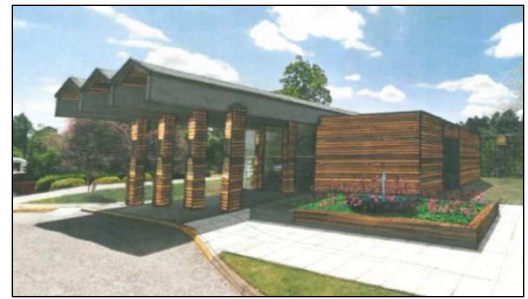
Artist Rendering – Front Entrance

Beautiful new wood screen façade updates have begun