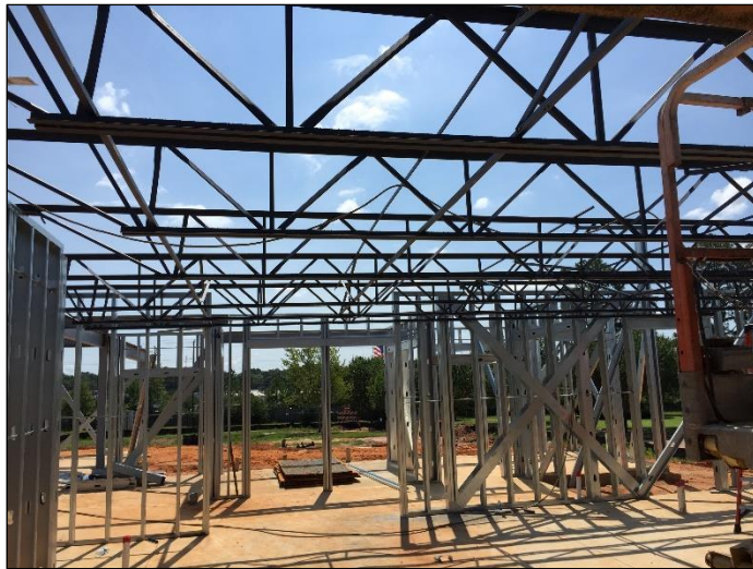
Construction on the new Rehabilitation household