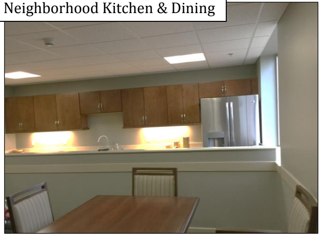
Neighborhood Kitchen & Dining